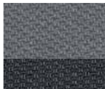
Medium Dark Flint Cloth

■ MEDIUM DARK FLINT ■ EBONY/RED ■ EBONY/BLUE ■ SOLID EBONY