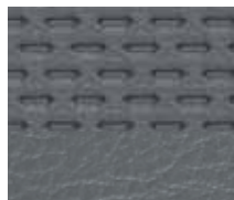
Medium Dark Flint Vinyl