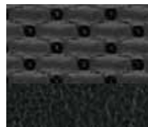
Solid Ebony Leather

1 FX4 OFF-ROAD standard two-tone paint lower portion is Dark Shadow Grey for all colors except Dark Shadow Grey Metallic. Two-tone Dark Shadow Grey Metallic upper exterior color will receive Black lower body color. 2 Limited production; Silver Metallic available late Fall 2008 on XLT, SPORT and FX4 OFF-ROAD; available entire year on XL.