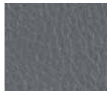
Medium Dark Flint Leather