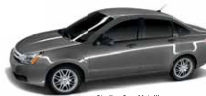
Sterling Grey Metallic