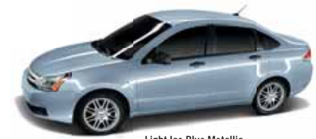
Light Ice Blue Metallic

Ford uses clearcoat paint for beauty and protection. Colors shown are representative only. Not all colors are available on all models. See your dealer for actual paint/trim options. Vehicles shown may contain optional equipment.