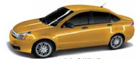
Amber Gold Metallic