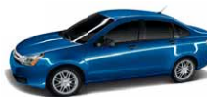
Vista Blue Metallic