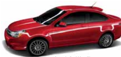
Sangria Red Metallic